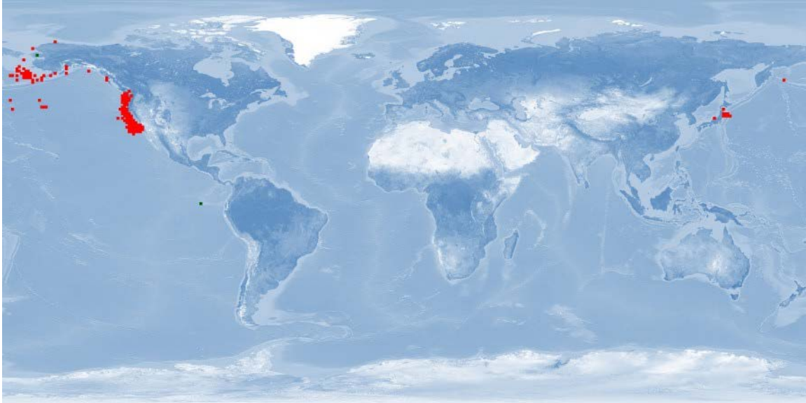
Figure 2: Northern fur seal ( Callorhinus ursinus )- available point occurrence records (GBIF download August 2013). Note that green records represent species misidentification or museum records and associated points are not included in the envelope calculations. An additional record from the Beaufort Sea was manually excluded (unrepresentative vagrant) based on available information about regular species occurrences