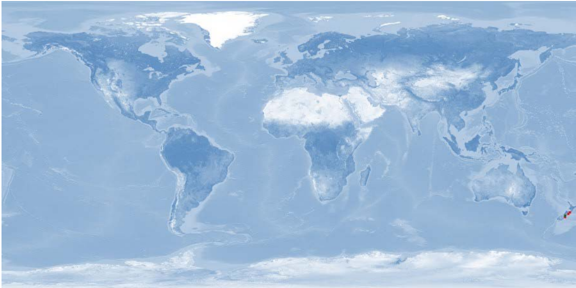
Figure 2: Hector's dolphin ( Cephalorhynchus hectori )- available point occurrence records (GBIF download August 2013). Note that green records represent species misidentification or museum records and associated points are not included in the envelope calculations. There are less than 10 “good cells” (i.e. presence records in cells known to fall within the geographic range of the species) and therefore insufficient data to calculate envelopes from occurrence records. All envelope settings are therefore based on expert knowledge only.