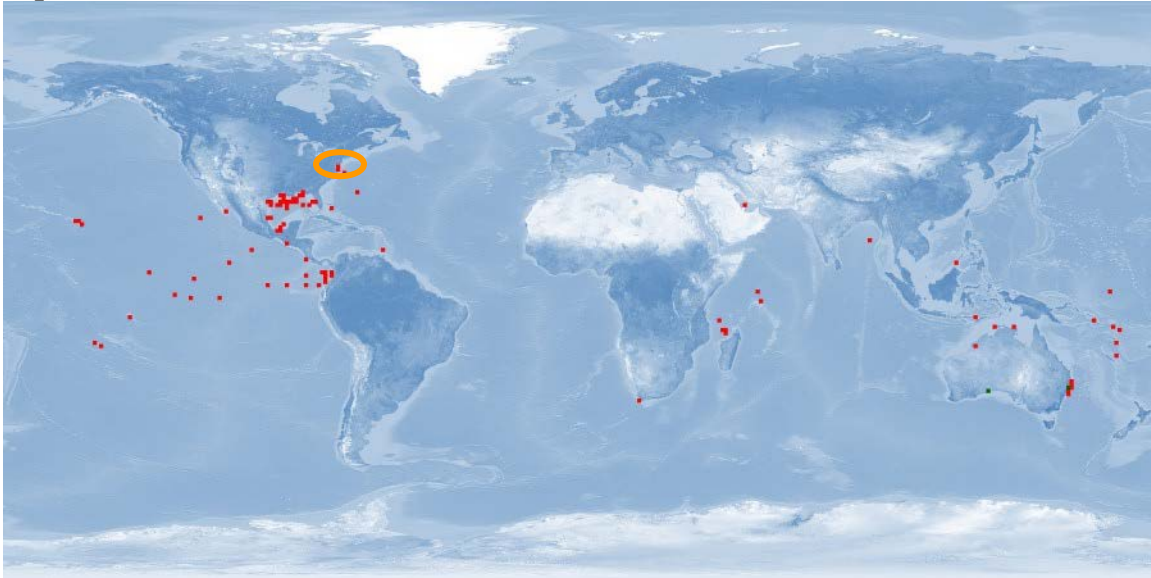
Figure 2: Melon-headed whale ( Peponocephala electra ) - available point occurrence records (GBIF download August 2013). Note that green records represent species misidentification, fossil or museum records and associated points are not included in the envelope calculations. Some additional records along the northern coast of the US were manually excluded (unrepresentative vagrant) based on available information about regular species occurrences.