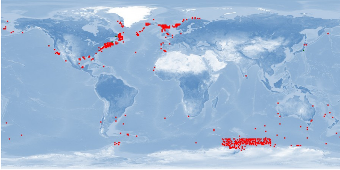
Figure 2: Sei whale ( Balaenoptera borealis )- available point occurrence records (GBIF download August 2013). Note that green records represent species misidentification, fossil or museum records and associated points are not included in the envelope calculations.